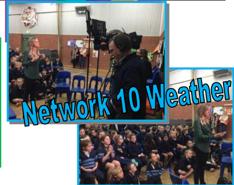
Network 10 Weather