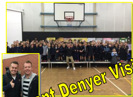
Grant Denyer Visit