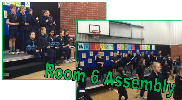
Room 6 Assembly